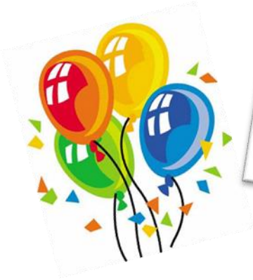
Umer in Year 4